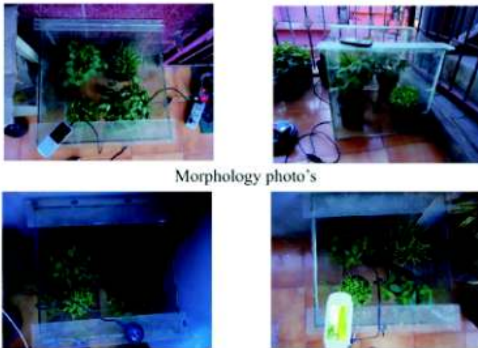
Figure 1 : A Series of Experiment Conducted on Plants to Perform The Protein Production

Music is a vibratory phenomenon. Air particles are set in motion and these air particles in turn set matter that is within hearing distance into motion. This is called vibrational sympathy: when the vibrations of sound effect