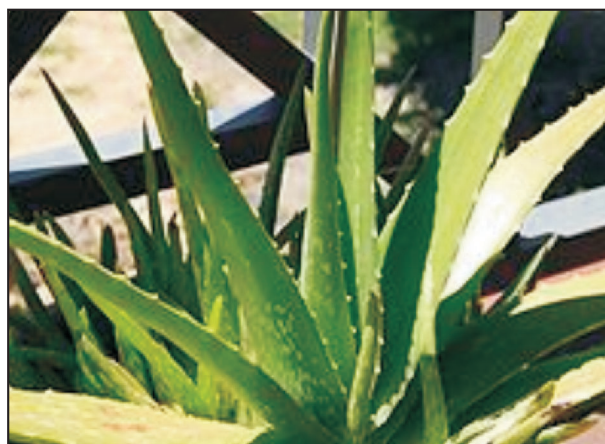
Figure 1 : Aloe barbadensis

The worldwide prevalence of diabetes for all age groups was estimated to be 2.8 percent in 2000 and it is projected to be 5.4 percent in 2025.